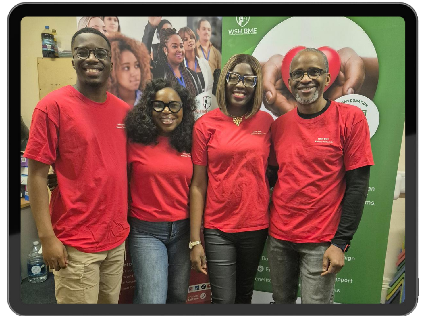
Hosted events with over 100 attendees