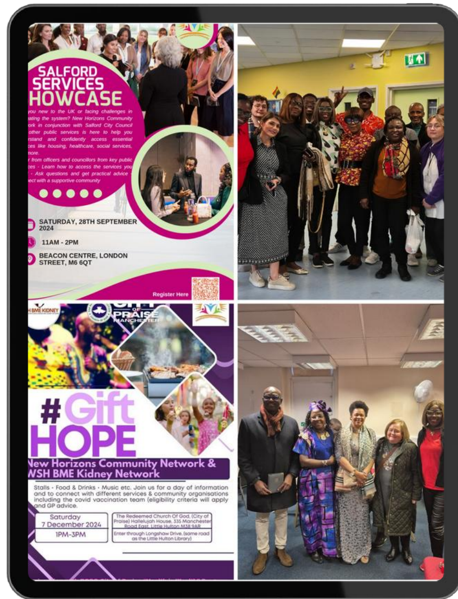
Trust and familiarity drive participation.