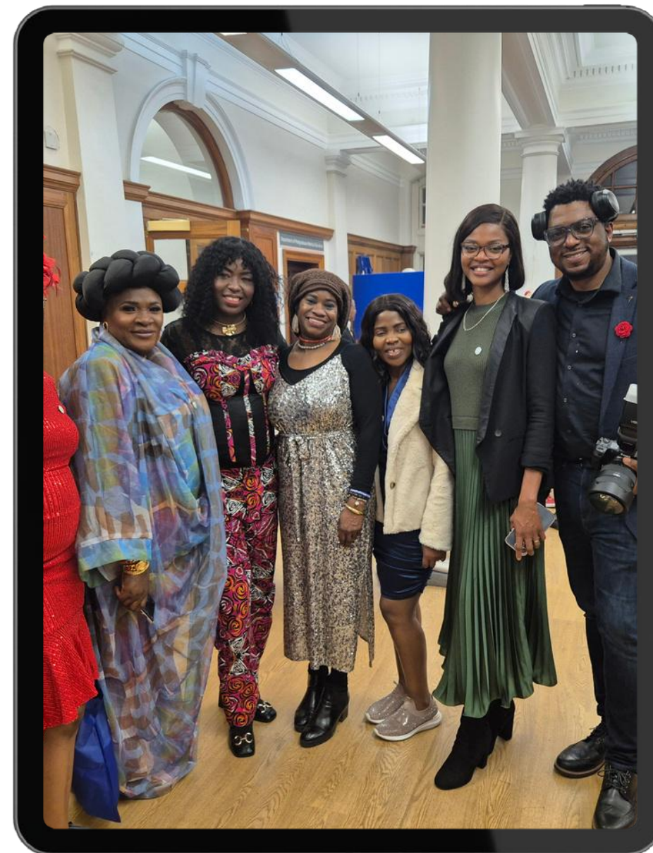
Cultural sensitivity improves engagement.